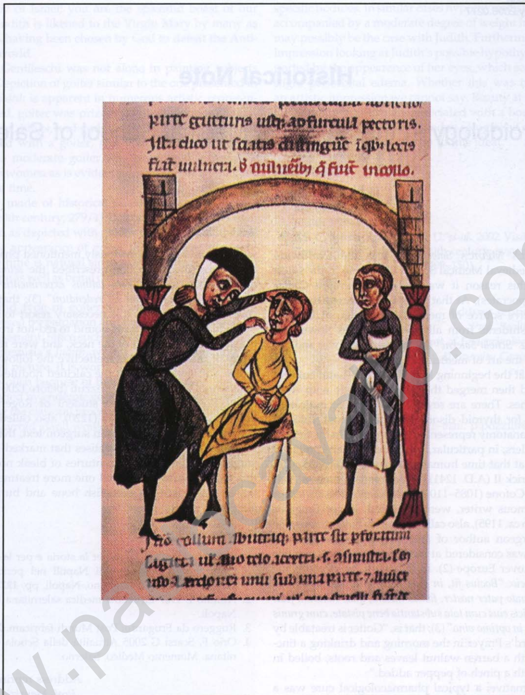
FIG. 1. From Rolando de' Capezzuti's Cirurgia , Rome, Casanatese Library, Ms. Nr. 1382 (A. II. 15). The picture shows a doctor performing a surgery in a human thyroid gland.